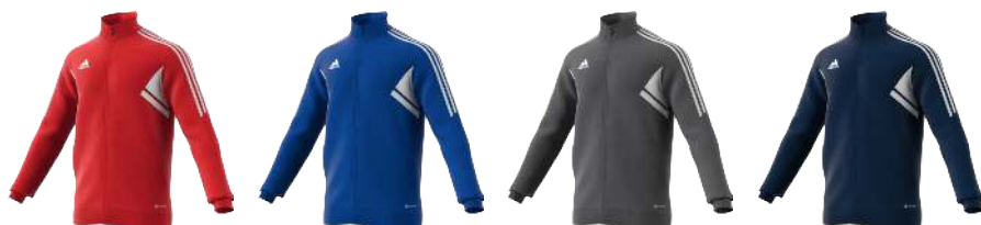
HA6250 12/01/21 HB0005 12/01/21 HD2286 12/01/21 HA6249 12/01/21