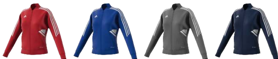
HA6243 12/01/21 HB0002 12/01/21 HD2280 12/01/21 HA6242 12/01/21