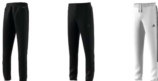
GN5495 12/01/21 GN5494 12/01/21