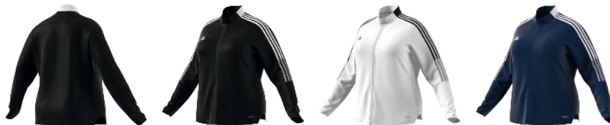
GN2171 12/01/21 GU8193 12/01/21 GJ5663 12/01/21

Born for the beautiful game, adidas Tiro gets as much love off the pitch as it does on it. We gave this track jacket colourblocked details for a bold look. As you'd expect from a top with such sporty credentials, it has sweat-wicking AEROREADY to keep you dry. And the best part? It's created using recycled materials, part of our commitment to help end plastic waste.