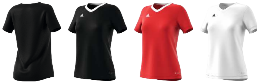
H57572 2/1/22 H57571 2/1/22 HC5074 2/1/22