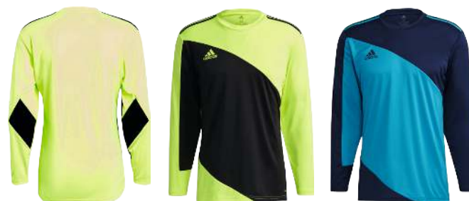
GN5795 12/01/21 GN6944 12/01/21