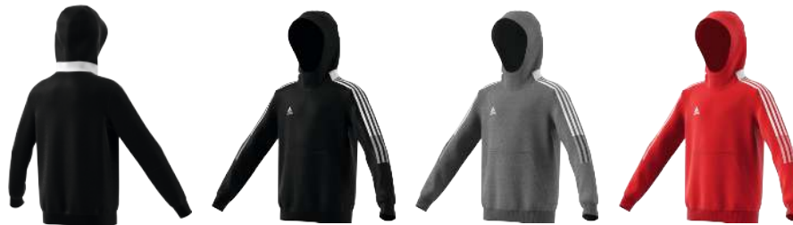
GM7326 12/01/21 GP8803 12/01/21 GM7338 12/01/21

Relax, regroup, recover. This juniors' adidas hoodie is ideal for the quieter moments of soccer, like stretching before a match or heading home when training is over. The cotton-blend fleece feels soft and cozy. Pull up the roomy hood when you want to take a breather.