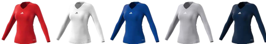
GN5715 12/01/21 GN5716 12/01/21 GK9089 12/01/21 GN5717 12/01/21 GN5714 12/01/21