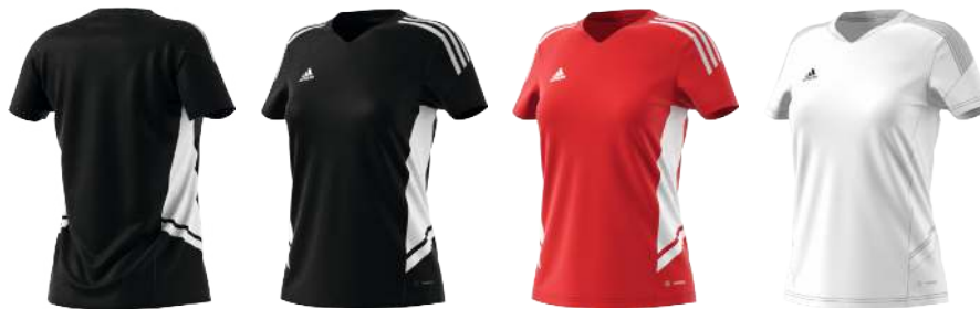
H21258 12/01/21 HD4725 12/01/21 HD4728 12/01/21