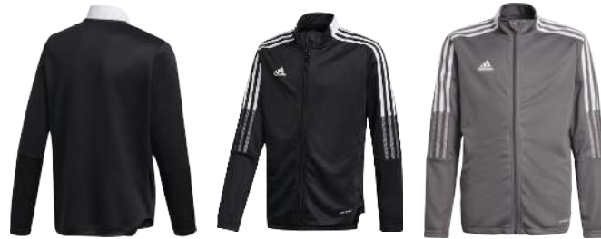
GM7314 12/01/21 GM7311 12/01/21

Too good to limit to the pitch. The adidas Tiro jacket debuted as soccer training wear, but it's now a streetwear staple. We made this juniors' version using recycled materials as part of our commitment to help end plastic waste. From the moisture-absorbing AEROREADY to the zip pockets, the details are just as useful off the field.