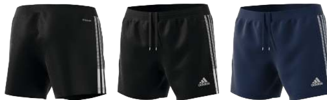
GN2158 12/01/21 GK9682 12/01/21

Feel good. Look good. Train better. Rooted in soccer heritage, these Tiro 21 shorts grace the pitch with a focus on performance. Made to move, they field soft fabric, moisture-absorbing AEROREADY and heat-transfer details. They also contain recycled materials, another small step in adidas' efforts to help end plastic waste. This product is made with Primegreen, a series of high-performance recycled materials.