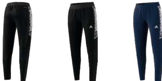
GK9571 12/01/21 GH7131 12/01/21

Training sessions alone don't win matches, but each one plays a part. Created using Primeblue made with Parley Ocean Plastic, these adidas Condivo 21 soccer pants score another small victory in the battle against plastic waste. Moisture-absorbing AEROREADY ensures you stay dry and focused. The tapered fit means nothing will foul your footwork.