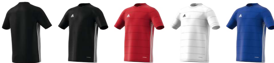
FT6756 12/01/21 FT6759 12/01/21 GN5737 12/01/21 FT6758 12/01/21