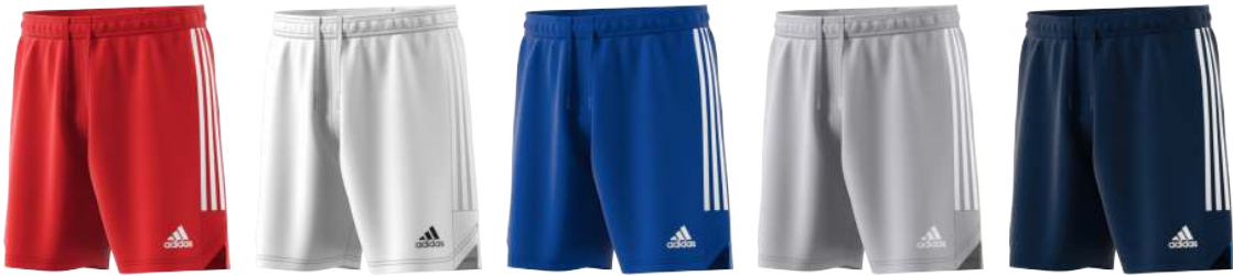
HA0600 12/01/21 HA3509 12/01/21 HA0599 12/01/21 HA3504 12/01/21 HA3505 12/01/21