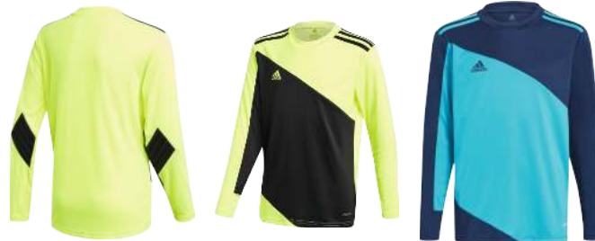
GN5794 12/01/21 GN6947 12/01/21

Stand out when it's time to dominate your territory. The clean, bold blocks of color on this juniors' adidas soccer jersey keep you visible when your area turns into a scene. It also gives you room to add your own club details. Cushioning helps you dive with confidence. Moisture-wicking AEROREADY ensures you stay comfortable.