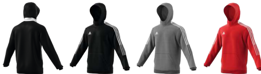
GM7341 12/01/21 GP8805 12/01/21 GM7353 12/01/21

Relax, regroup, recover. This adidas hoodie is ideal for the quieter moments of soccer, like stretching before a match or heading home when training is through. The cotton-blend fleece feels soft and cozy. Pull up the roomy hood while you take a breather.