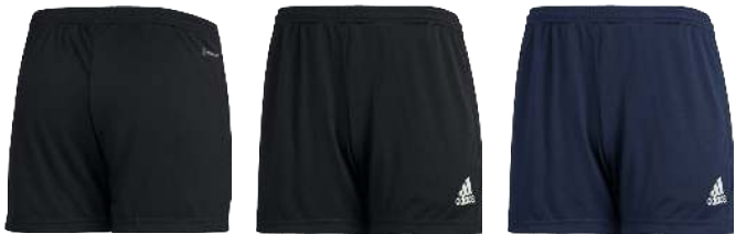
H57492 12/01/21 H57494 12/01/21

ENTRADA22 Training Shorts Women S2206GHTT410W $25.00