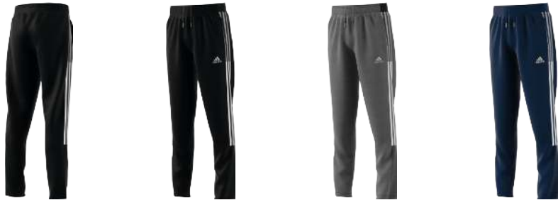
GM7332 12/01/21 GP8809 12/01/21 GK9675 12/01/21

Relax, regroup, recover. These juniors' adidas sweat pants are ideal for the quieter moments of soccer, like stretching before a match or heading home when training is over. The cotton-blend fleece feels soft and cozy. Zip pockets keep essentials close.