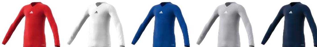
GN5711 12/01/21 GN5713 12/01/21 GK9087 12/01/21 GN5709 12/01/21 GN5712 12/01/21