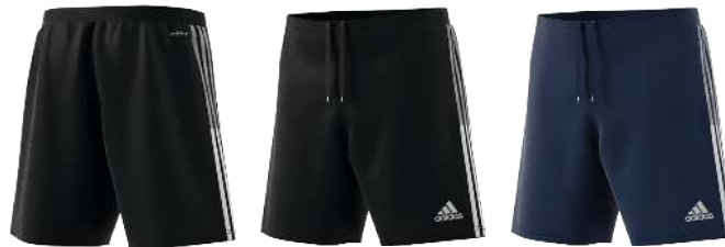
GN2157 12/01/21 GH4471 12/01/21

Feel good. Look good. Train better. These adidas soccer shorts are a classic Tiro style and made with the planet in mind. Moisture-absorbing AEROREADY keeps you dry on the training pitch, and zip pockets give you space for essentials. This product is made with Primegreen, a series of high-performance recycled materials.