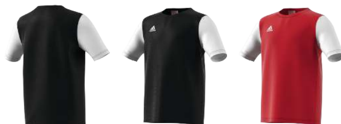
DP3220 12/01/21 DP3215 12/01/21