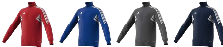
HA6256 12/01/21 HA6257 12/01/21 HD2284 12/01/21 H21282 12/01/21

CONDIVO22 TRACK JACKET YOUTH S2206GHTT008Y $65.00