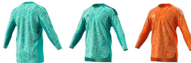
HB1613 12/01/21 HB1617 12/01/21

CONDIVO 22 GK JERSEY LONGSLEEVE MEN S2206GHTM001L $65.00