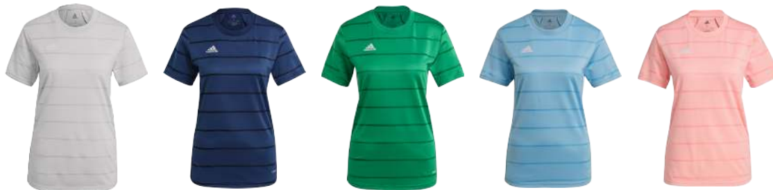
GN5732 12/01/21 GN5733 12/01/21 GN6704 12/01/21 GN6703 12/01/21 GN5731 12/01/21