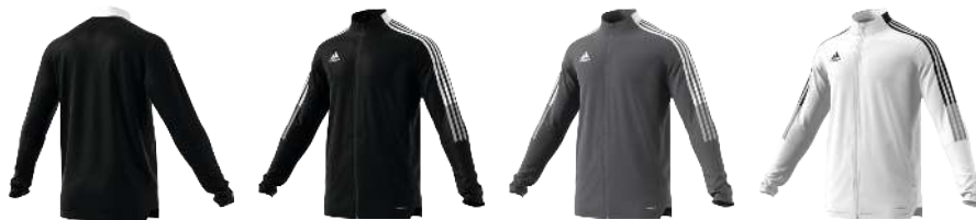
GM7319 12/01/21 GM7306 12/01/21 GM7309 12/01/21

Tiro 21 Track Jacket $50.00 S2106GHTT104