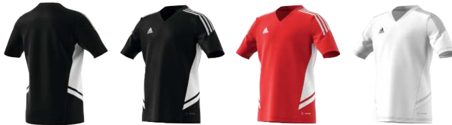
HA6278 12/01/21 HA6280 12/01/21 HD4718 12/01/21