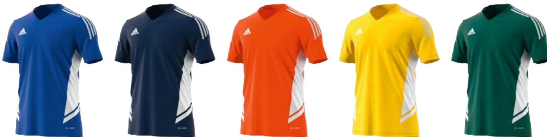
HA6285 12/01/21 HA6291 12/01/21 HE3059 12/01/21 HD2267 12/01/21 HE3057 12/01/21