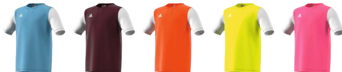
FT6559 12/01/21 DP3224 12/01/21 DP3227 12/01/21 DP3229 12/01/21 DP3228 12/01/21