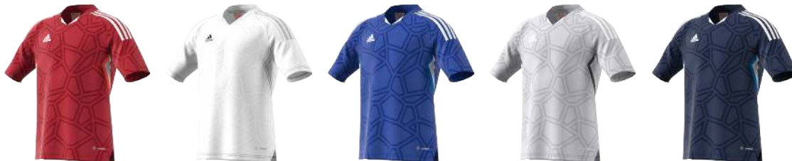
HA3567 12/01/21 HA3558 12/01/21 GS0180 12/01/21 HA3559 12/01/21 HA3560 12/01/21