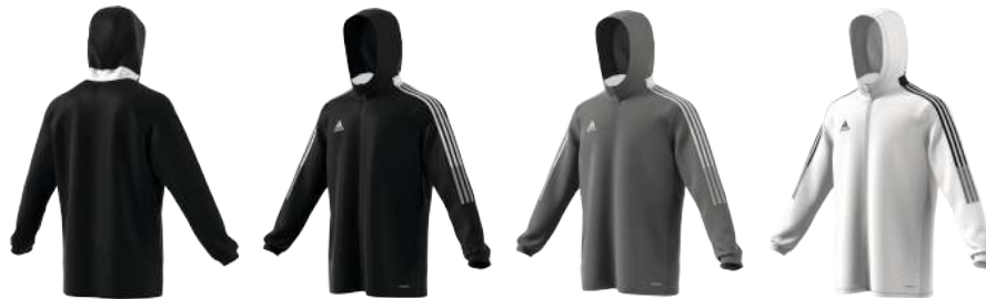
GP4967 12/01/21 GP4964 12/01/21 GP4966 12/01/21

You can't always be a force of nature in soccer training. So when the intensity drops and the breeze picks up, this adidas Tiro 21 Windbreaker has you covered on the sidelines. Moisture-absorbing AEROREADY and a mesh lining help keep you dry while you're sheltering. The streamlined silhouette means you can stay mobile while you're waiting for the gusts to die down.