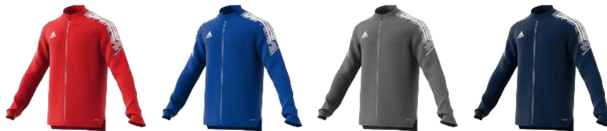
GH7124 12/01/21 GH7130 12/01/21 GP1900 12/01/21 GE5412 12/01/21