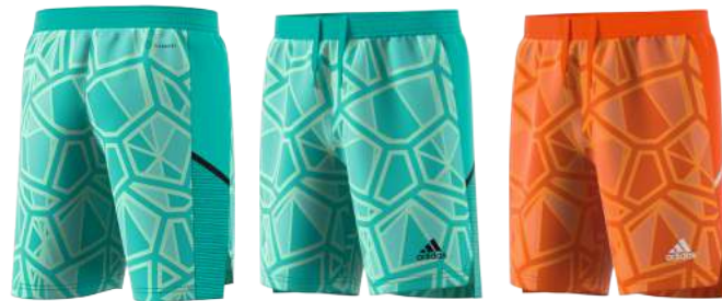
HB1668 12/01/21 HB1669 12/01/21