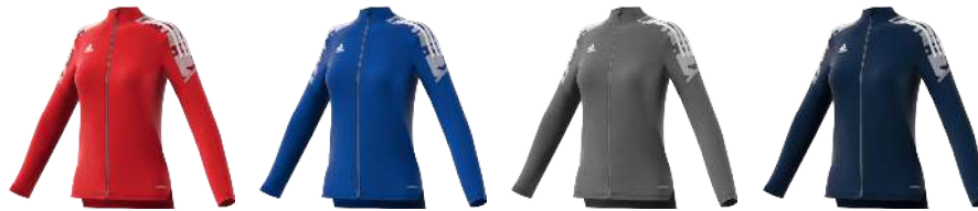
GH7142 12/01/21 GH7141 12/01/21 GP1899 12/01/21 GK9575 12/01/21