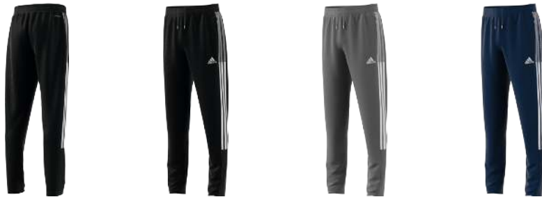
GM7374 12/01/21 GM7384 12/01/21 GK9666 12/01/21