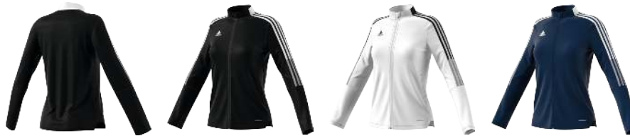
GM7307 12/01/21 GM7302 12/01/21 GK9663 12/01/21

Too good to limit to the pitch. The adidas Tiro jacket debuted as soccer training wear, but it's now a streetwear staple. We made it using recycled materials as part of our commitment to help end plastic waste. From the moisture-absorbing AEROREADY to the zip pockets, the details are just as useful off the pitch.