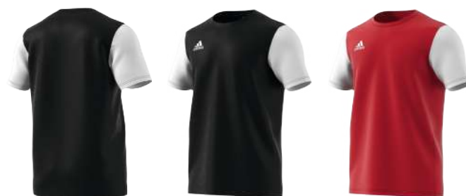
DP3233 12/01/21 DP3230 12/01/21