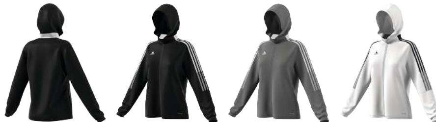
GP4969 12/01/21 GP4971 12/01/21 GP4970 12/01/21

You can't always be a force of nature in soccer training. So when the intensity drops and the winds pick up, this adidas Tiro 21 Windbreaker has you covered. Moisture-absorbing AEROREADY and a mesh lining keep you dry. The streamlined silhouette ensures nothing gets in the way of your ball skills on the touchline.