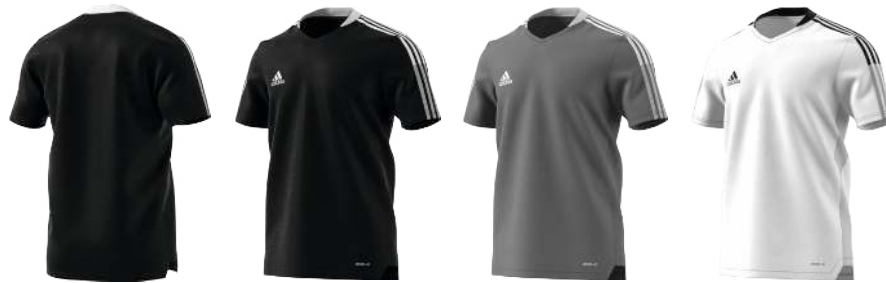
GM7586 12/01/21 GM7587 12/01/21 GM7590 12/01/21