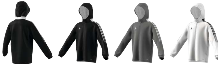
GP4975 12/01/21 GP4977 12/01/21 GP4979 12/01/21

You can't always be a force of nature in soccer training. So when the intensity drops and the winds pick up, this juniors' adidas Tiro 21 Windbreaker has you covered. Moisture-absorbing AEROREADY and a mesh lining keep you dry. The streamlined silhouette ensures nothing gets in the way of your ball skills on the touchline.