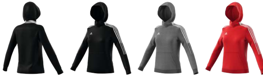
GM7329 12/01/21 GP8804 12/01/21 GM7327 12/01/21

Relax, regroup, recover. This adidas hoodie is ideal for the quieter moments of soccer, like stretching before a match or heading home when training is over. A nice little post-game bonus, its cosy cotton-blend fleece will feel soft against your skin. And when you want to disappear into your personal match highlights reel, all you need to do is pull up its roomy lined hood.