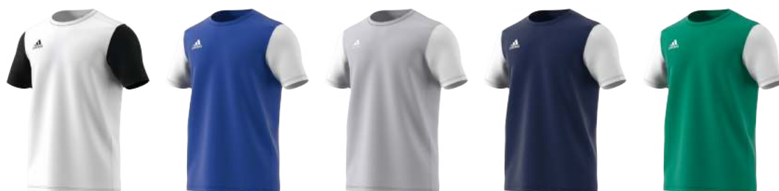
DP3234 12/01/21 DP3231 12/01/21 FT6558 12/01/21 DP3232 12/01/21 DP3238 12/01/21