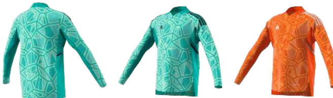
HB1642 12/01/21 HB1645 12/01/21

CONDIVO 22 GK JERSEY LONGSLEEVE YOUTH $55.00 S2206GHTM001LY Sizes: XXS | XS | S | M | L | XL HB1642 mint rush HB1645 orange