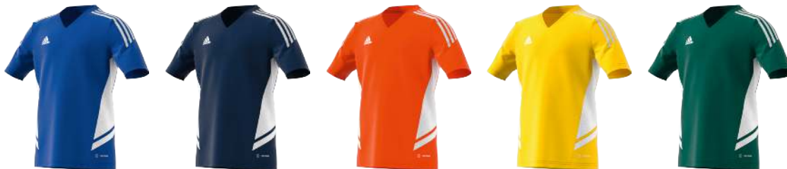
HA6279 12/01/21 H21257 12/01/21 HE3065 12/01/21 HD2321 12/01/21 HE3064 12/01/21

CONDIVO22 JERSEY YOUTH $40.00 S2206GHTT001Y