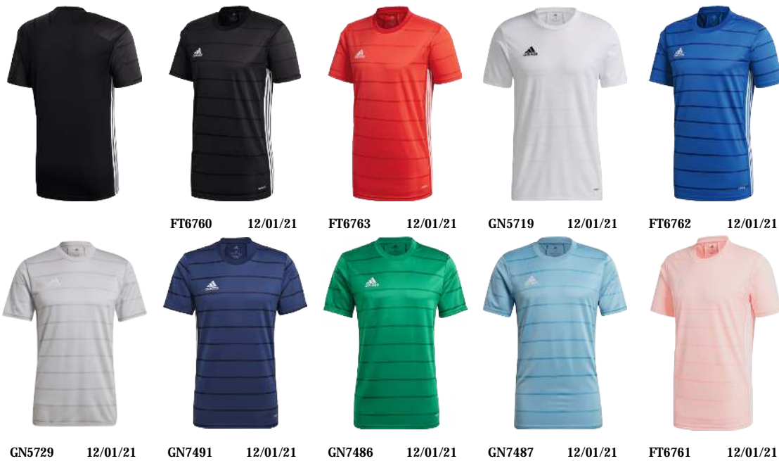
FT6760 12/01/21 FT6763 12/01/21 GN5719 12/01/21 FT6762 12/01/21