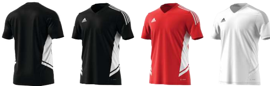
H21254 12/01/21 HA6286 12/01/21 HD2275 12/01/21