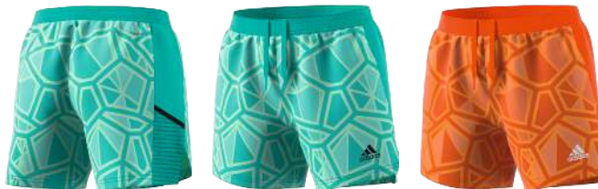
HB1663 12/01/21 HB1660 12/01/21

CONDIVO GK 22 SHORT WOMEN $35.00 S2206GHTM102W Sizes: XXS | XS | S | M | L | XL | XXL HB1663 mint rush HB1660 orange