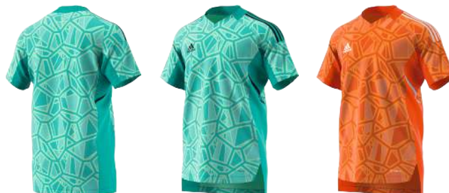
HB1618 12/01/21 HB1621 12/01/21

CONDIVO 22 GK JERSEY SHORTSLEEVE MEN S2206GHTM001 $60.00