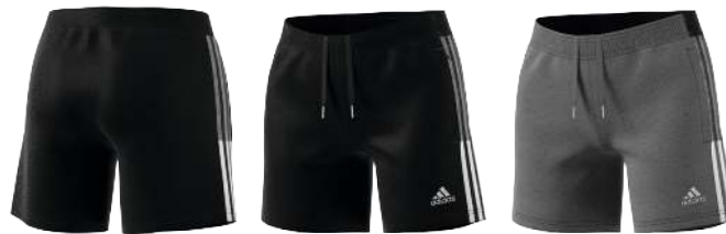
GM7330 12/01/21 GP8807 12/01/21

Tiro 21 Sweat Shorts Women $35.00 S2106GHTT111W