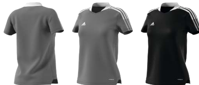
GM7581 12/01/21 GM7582 12/01/21