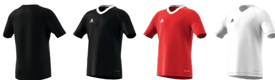
H57497 02/1/22 H57496 2/1/22 HC5054 2/1/22