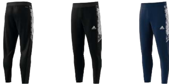
GE5423 12/01/21 GH7134 12/01/21

Training sessions alone don't win matches, but each one plays a part. Created using Primeblue made with Parley Ocean Plastic, these adidas Condivo 21 soccer pants score another small victory in the battle against plastic waste. Sweat-wicking AEROREADY keeps you dry when you're putting everything in. The tapered fit ensures nothing gets between your feet and the ball when it's time to show your skills.