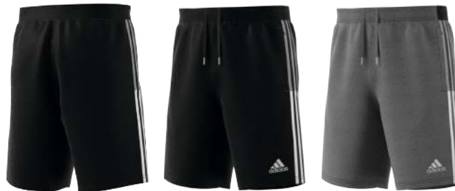
GM7345 12/01/21 GP8808 12/01/21

Relax, regroup, recover. These adidas soccer shorts are perfect for those moments on either side of the action. Pull them on when you're stretching before a game or when it's time to head home. The cozy, cotton-blend fleece ensures you stay comfortable. Zip pockets keep your valuables securely stowed.