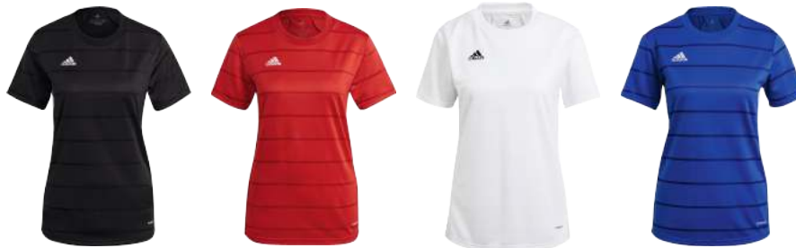
GN5730 12/01/21 GN5734 12/01/21 GN5735 12/01/21 GK9086 12/01/21