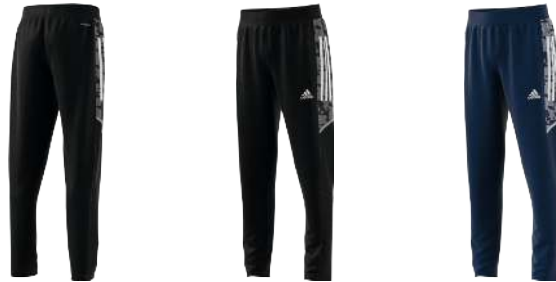
GK9572 12/01/21 GH7132 12/01/21

Condivo 21 Primeblue Training Pants Youth $50.00 S2106GHTT005Y