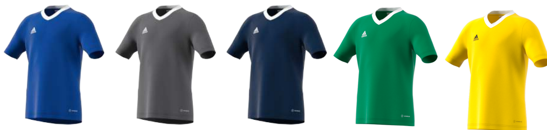
HG3948 2/1/22 H57499 2/1/22 H57564 2/1/22 HI2126 2/1/22 HI2127 2/1/22

ENTRADA22 Jersey Youth $18.00 S2206GHTT420Y