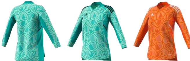
HB1659 12/01/21 HB1656 12/01/21

CONDIVO 22 GK JERSEY LONGSLEEVE WOMEN $65.00 S2206GHTM001LW Sizes: XXS | XS | S | M | L | XL | XXL HB1659 mint rush HB1656 orange