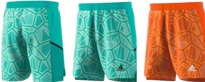
HB1624 12/01/21 HB1627 12/01/21

CONDIVO GK 22 SHORT MEN $35.00 S2206GHTM102 Sizes: XS | S | M | L | XL | XXL HB1624 mint rush HB1627 orange