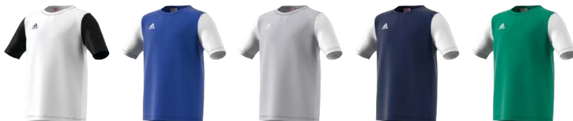
DP3221 12/01/21 DP3217 12/01/21 FT6560 12/01/21 DP3219 12/01/21 DP3216 12/01/21