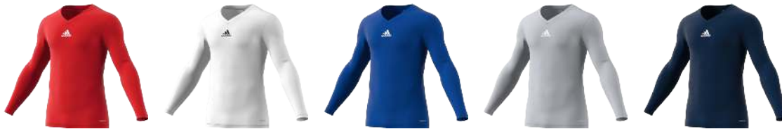
GN5674 12/01/21 GN5676 12/01/21 GK9088 12/01/21 GN5708 12/01/21 GN5675 12/01/21