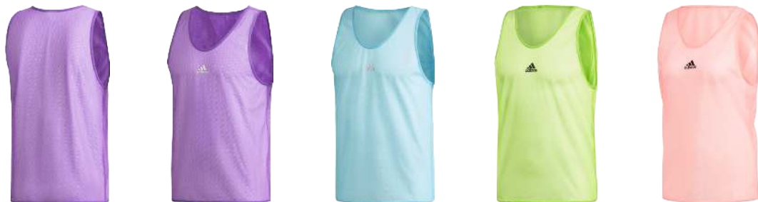
FM4407 12/01/21 FM4408 12/01/21 FM4409 12/01/21 FM4410 12/01/21