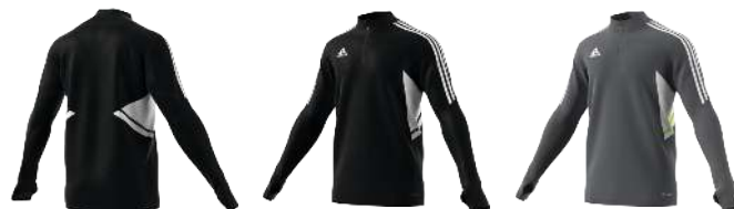
HA6269 12/01/21 HD2312 12/01/21

CONDIVO22 TRAINING TOP S2206GHTT004N $65.00