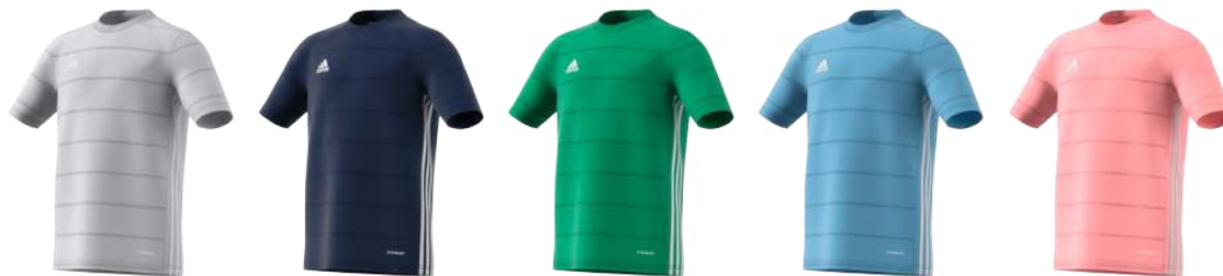
GN5736 12/01/21 GN7495 12/01/21 GN7494 12/01/21 GN7493 12/01/21 FT6757 12/01/21