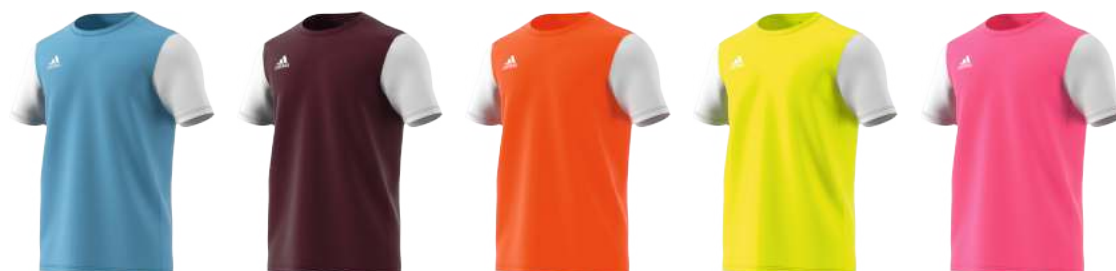
FT6561 12/01/21 DP3239 12/01/21 DP3236 12/01/21 DP3235 12/01/21 DP3237 12/01/21