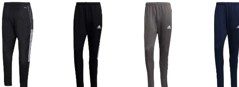
GH7305 12/01/21 GJ9868 12/01/21 GE5425 12/01/21

Too good to limit to the pitch. The adidas Tiro pants debuted as training wear, but they're now a streetwear staple. Ankle zips allow you to pull these pants on over sneakers. Moisture-absorbing AEROREADY ensures you stay dry no matter where life takes you.