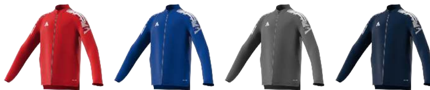
GH7137 12/01/21 GH7140 12/01/21 GP1898 12/01/21 GK9576 12/01/21