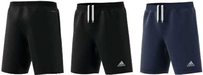
H57498 12/01/21 H57500 12/01/21

ENTRADA22 Training Shorts Youth S2206GHTT410Y $23.00