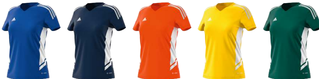
HD4724 12/01/21 HA6289 12/01/21 HE3061 12/01/21 HD4730 12/01/21 HE3060 12/01/21

CONDIVO22 JERSEY WOMEN $45.00 S2206GHTT001W