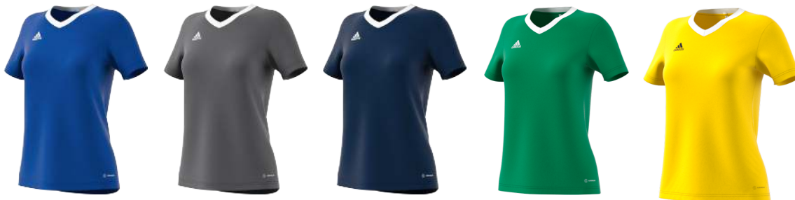
HG3947 2/1/22 H59848 2/1/22 H59849 2/1/22 HI2124 2/1/22 HI2125 2/1/22

ENTRADA22 JERSEY WOMEN $20.00 S2206GHTT420W